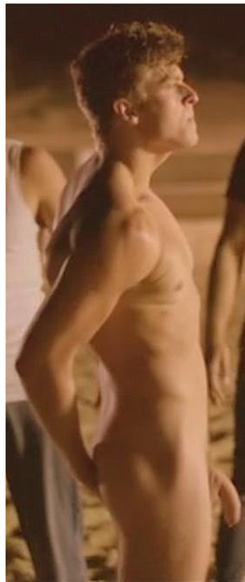
A hint: He's been in recent movies, including one that sounds "underwater". ▼

The answer to who the guy shown here is will be in the next issue.